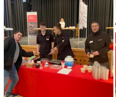
KIEFER at the training fair