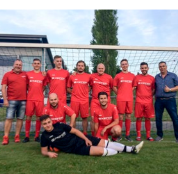
Participation in sport events