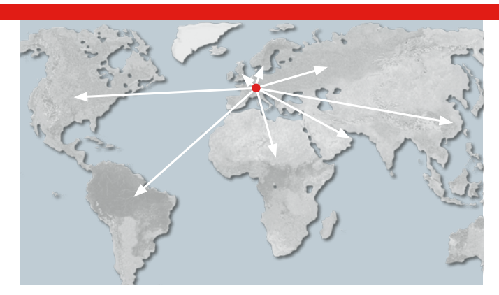
KIEFER molds are used worldwide!